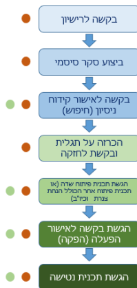
סיטור דרך הרישוי - שחזור שקף