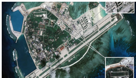
19 Woody Island