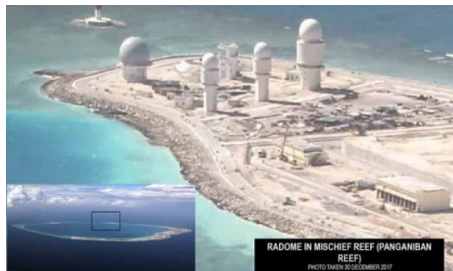
18 Mischief Reef